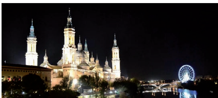
FIESTA DEL PILAR - ZARAGOZA